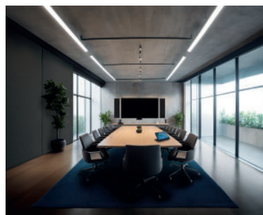
CORPORATE MEETING ROOM