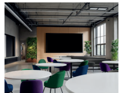
PRESENTATION/ TRAINING SPACE